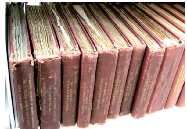
Bound volumes of "professional clippings of amateur journalism" from the Edwin Hadley Smith Collection, as shelved in one of the vaults in Special Collections.