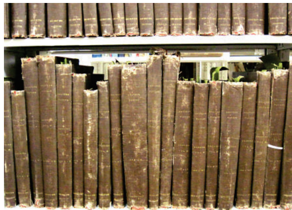
The heart of the Edwin Hadley Smith Collection: bound volumes of AJ issues arranged by year and then alphabetically within a year.