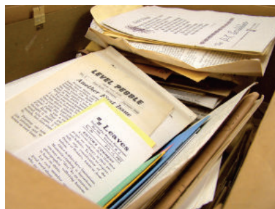
One of the cartons of AJ issues from the Keffers collection still to be sorted, foldered, and rehoused in archival cartons.