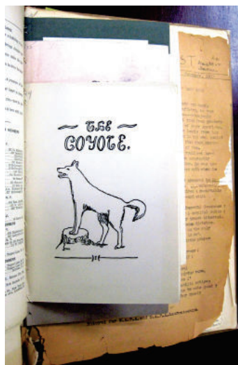
A browned and crumbling amateur journal issue follows relatively sturdy issues in one of the Edwin Hadley Smith (EHS) bound volumes (for 1917).