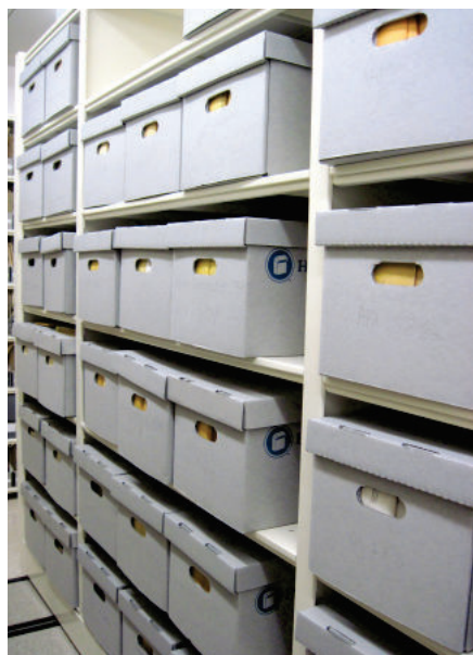
Archival carton upon carton containing AJ bundles, arranged by organization, and housed in one of the climate-controlled Special Collections vaults.