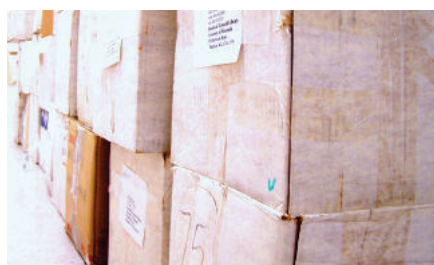
What lies ahead: sorting the contents of large cartons from the Keffers collection.