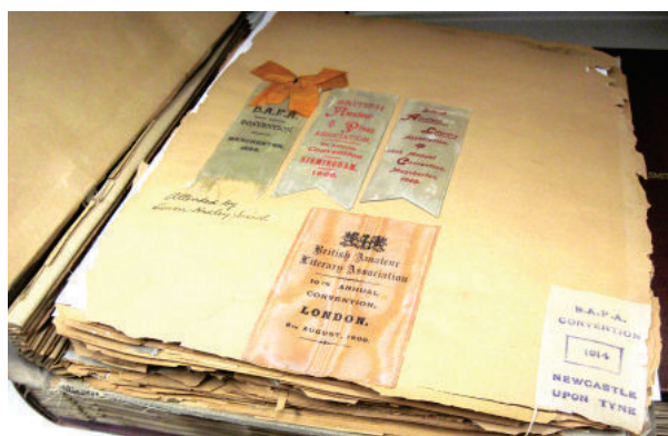
An EHS scrapbook page: the badges are in far better shape than the pages on which they are mounted.

We in Special Collections are honored to help preserve the Library of Amateur Journalism Collection and to make it available to researchers, and we appreciate very much the generosity of amateur journalism organizations and individuals for their direct contributions in support of processing the collection and contributions to an endowment fund for further work on the collection. We welcome your inquiries and would be delighted to welcome you in person in the Department of Special Collections. ♦