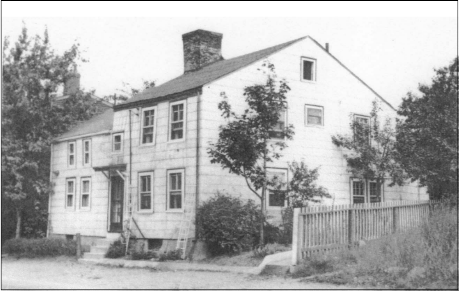
Parker Home 114 Riverside Avenue, Medford, Massachusetts